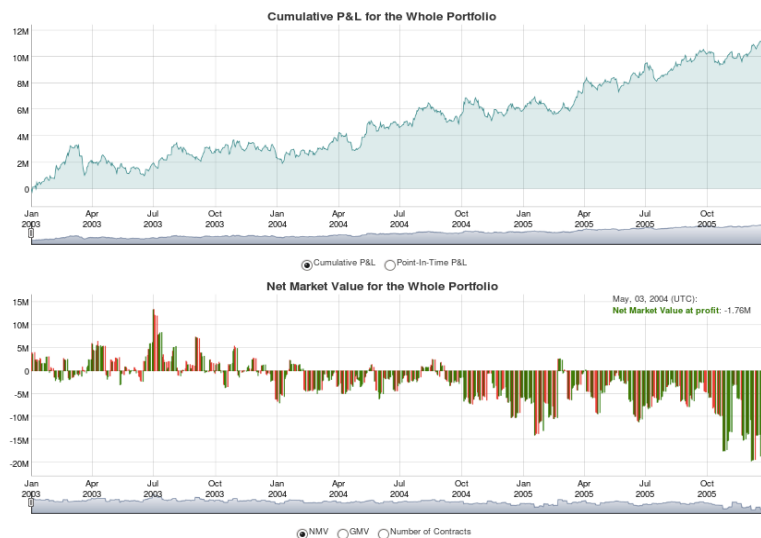
Figure 5: A screenshot of the plots with the commodity data frame. The P&L plots is displayed on the top, while the market value plots are on the bottom. Radio buttons at the bottom of the plots allow the user to seamlessly switch between plots.

Figure 5 provides a screenshot of the plots.