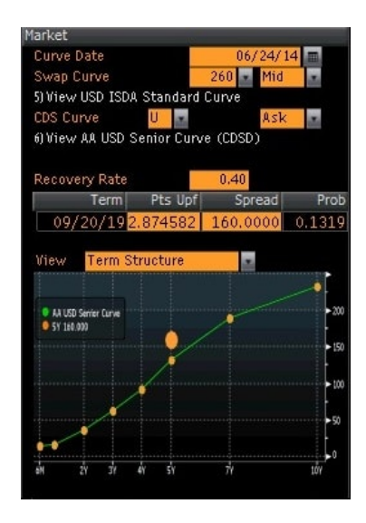
Figure 4: This figure is the Market section cropped from Figure 2. It shows information about market curve rates and CDS term structure. Curve Date is the date of LIBOR rates we use to price CDS. Recovery rate is the percent of a equity's value that can be recovered. Points upfront refers to the upfront payment as a percentage of the notional amount. Spread is the coupon rate we would have traded at before Big Bang Protocol standardized coupon rate. Default probability (or probability of default) is the risk-neutral probability of default that makes equal the potential cash flows from both buy and sell side of the CDS.