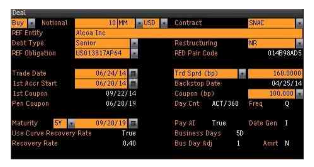
Figure 2: This is a figure of the Deal section cropped from Figure 1. Traders enter most of the CDS trade information in the Deal section, and Calculation section and Market section rely heavily on information provided in "Deal" section. Familiar terms are notional amount , trade date , trade spread , and coupon . Recall that trade spread is the coupon traders would have traded at before Big Bang Protocol standardized the coupon rate. Maturity means how long the protection contract lasts and when the coverage finishes. Here, the first slot "5Y" means the contract lasts 5 years, and second slot means that the contract will end on Sept. 20, 2019.

In the Deal section, REF Entity (Reference Entity) refers to the name of the company (Alcoa, in this case) and RED Pair Code is a Markit product that stands for Reference Entity Database. Each entity/seniority pair has a unique six-digit RED Pair Code that matches the first six digits of the nine-digit RED Pair Code, and a "preferred reference obligation," which is the default reference obligation for CDS trades. A user can input either the six-digit RED Pair Code or the nine-digit RED Pair Code. The input "014B98" is the six-digit RED Pair Code for "Alcoa". The label Debt type, marked as "Senior," refers to the seniority of the debt. The REF Obligation (Reference Obligation) refers to the bond involved in the CDS, and it matches the ISIN. The label Restructuring refers to which term of debt restructuring we agree on: For example, U.S. traders usually do not accept debt restructuring as CDS payment, and debt restructuring is often considered as bankcrupcy. Therefore, when trading CDS in U.S., we usually specify Restructuring to "NR," which stands for "No Restructuring." In Europe, however, traders usually consider certain types of debt restructuring to "MMR", which stands for Modified "Modified Restructuring".