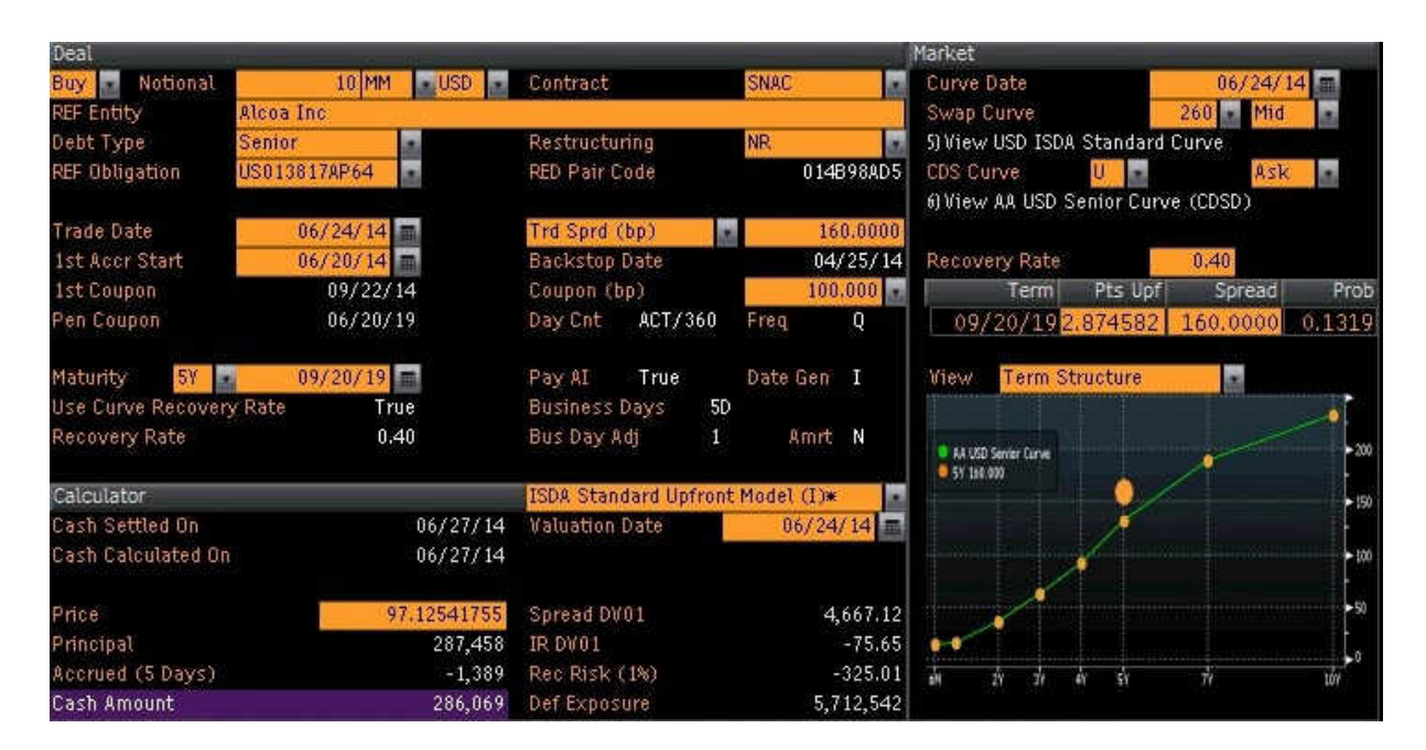
Figure 1: This is a Bloomberg Terminal screenshot that shows the details of an actual CDS transaction in Alcoa, priced on June 24, 2014 with 5 years of maturity. The screenshot consists of three sections: the Deal section (upperleft), Calculator section (bottomleft), and Market section (right side). The Deal section is where traders mostly input detailed information of the trade, such as trade date and coupon . The Calculator section shows the calculation results of the CDS contract after the trader has entered the trade information in the Deal section. Traders rely on these calculation results to make decisions on trades. The Market section shows information of the relevant market rates (such as LIBOR) that we concern as discount factors. This section also includes recovery rate and default probability .